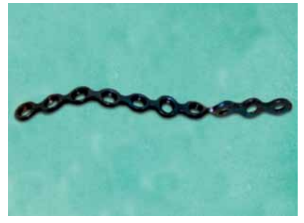
Fig. 3: Helicopter band incorporation in plate design

Condylar positioning device should be used in Le Fort osteotomies, bilateral sagittal split osteotomy and bimaxillary osteotomies. While securing the condylar