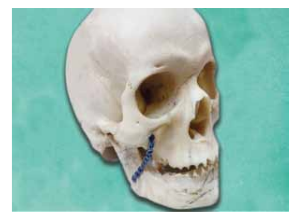
Fig. 2: Bone plate adaptation at zygomaticomaxillary buttress region and proximal ramus segment of the mandible